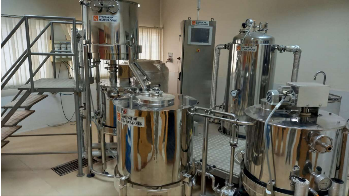
NANO BREWERY UNIT

The Department offers regular postgraduate course in M.Sc. (Wine, Brewing and Alcohol Technology), affiliated to the Savitribai Phule Pune University (SPPU), Pune. Department has state of art set up of pilot scale winery & nano brewery unit for hands on training to the students. Students are actively involved in utilization of Research facilities of the department for their practical and in-plant training course activity.